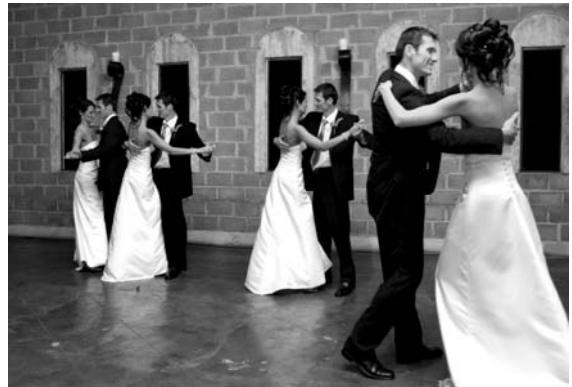
Image is very important and as such, a clean user-friendly professional looking website is a good start. Chances are if the company has spent money, time and effort on their website, they also do this on their service. Try emailing companies and see which ones return your message or call the quickest. This shows that they are a full-time business, not just a weekend-warrior.

Take a look at the references and testimonials on the website. Are they old and out-dated? Are they anonymous? Anyone can post testimonials from a great show they did in 1996, but in the entertainment business, you are only as good as your last gig! LOOK FOR RECENT TESTIMONIALS.